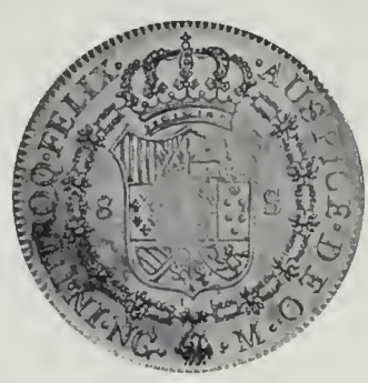
Lot No. 2460

Ferdinand VII. 8 Escudos, 1817 NG-M. Standard portrait of Ferdinand. C-T 18, Fr.22. Weak in 2460 the centers and struck on a slightly faulty planchet. One of only three dates issued during (3.500-4.500)this reign. Very Fine and very rare. (SEE COLOR PLATE)